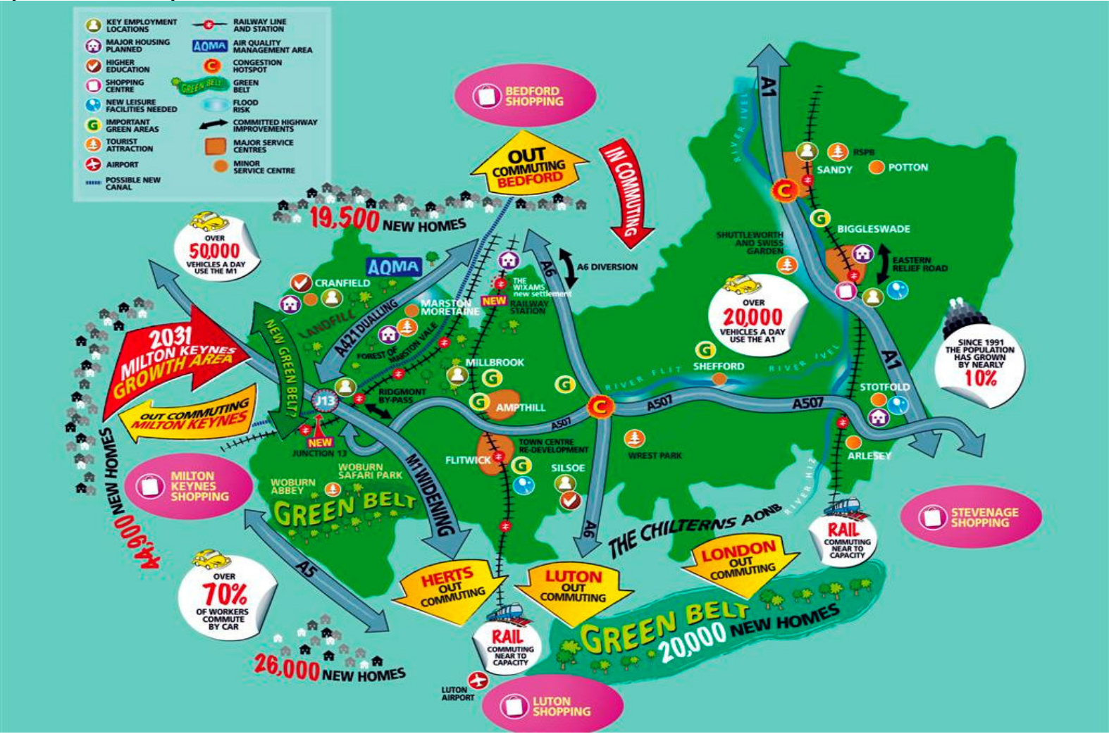
Figure 1: Spatial Issues Map